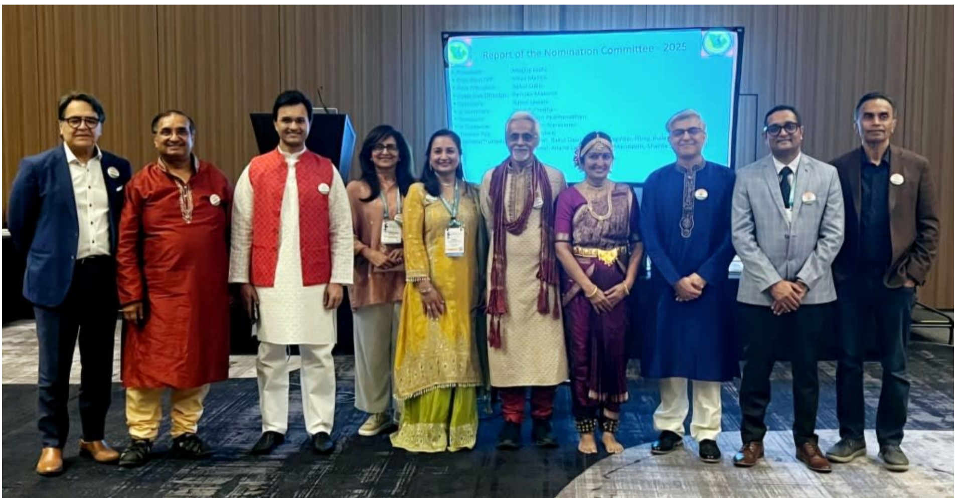
Committee Leads and Committee Members