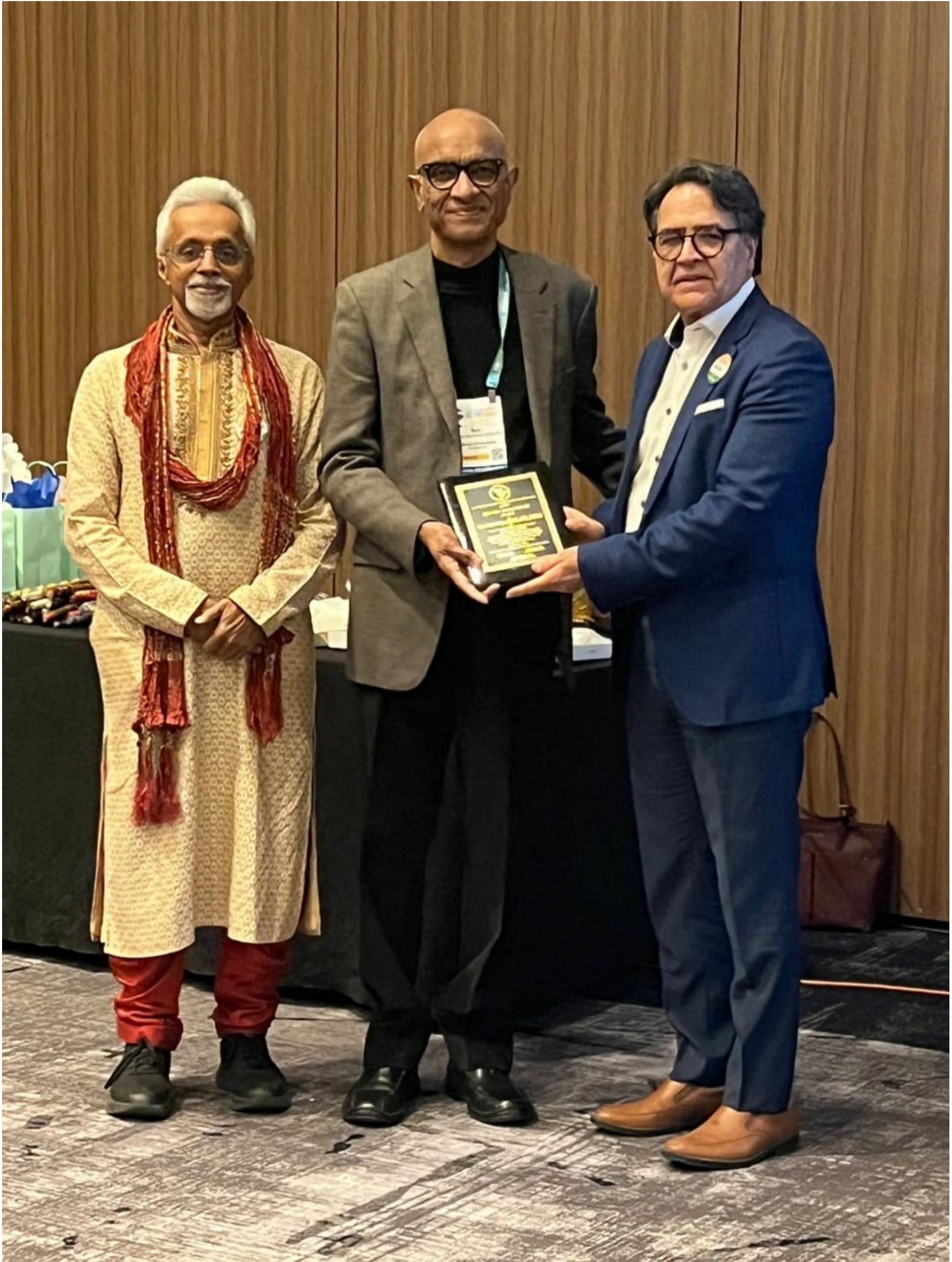
The Abstract awards to young and enthusiastic residents was a highlight, as well as the newly instituted Observership awards.