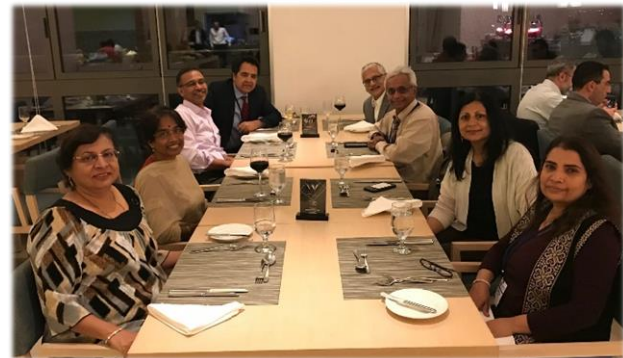
Dinner after the conference presentation